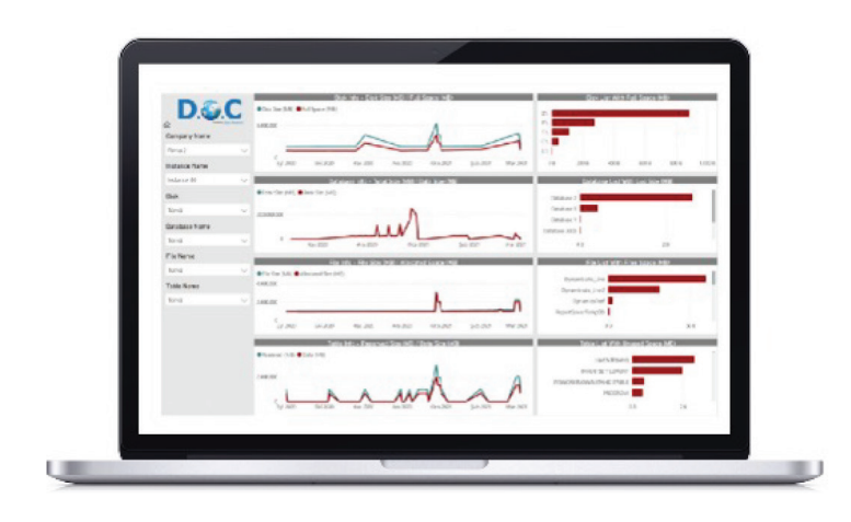
Figure 1: Powerbi dashboard view that comes from as a service Power Bi Reporting server.

Report any situation may cause malfunction with warnings and solution suggestions.